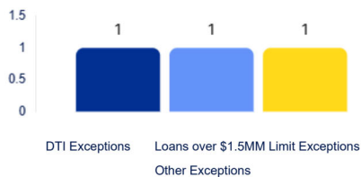
2025 Commercial Lending Exception Reasons